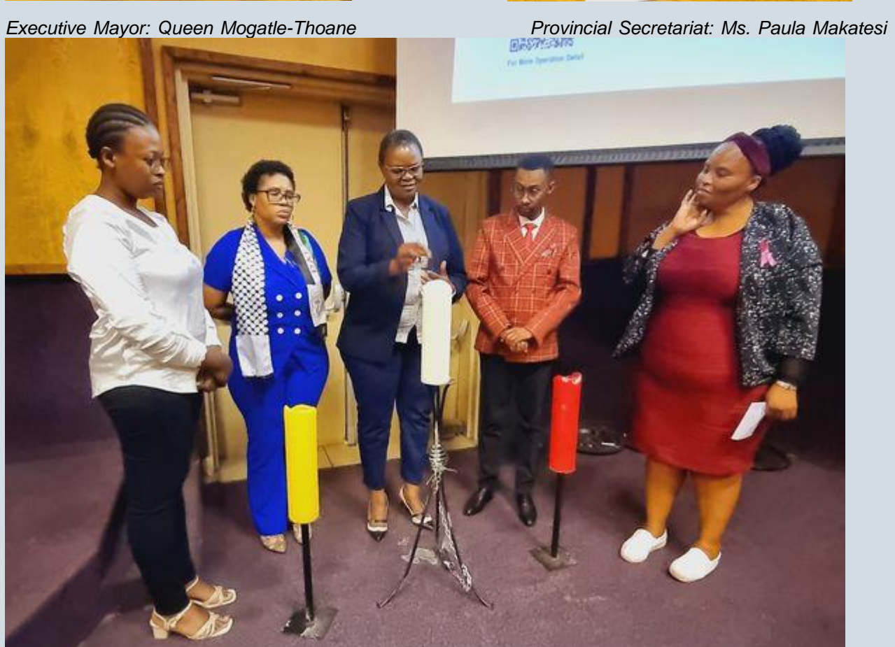
Executive Mayor and Members of the Civil Society