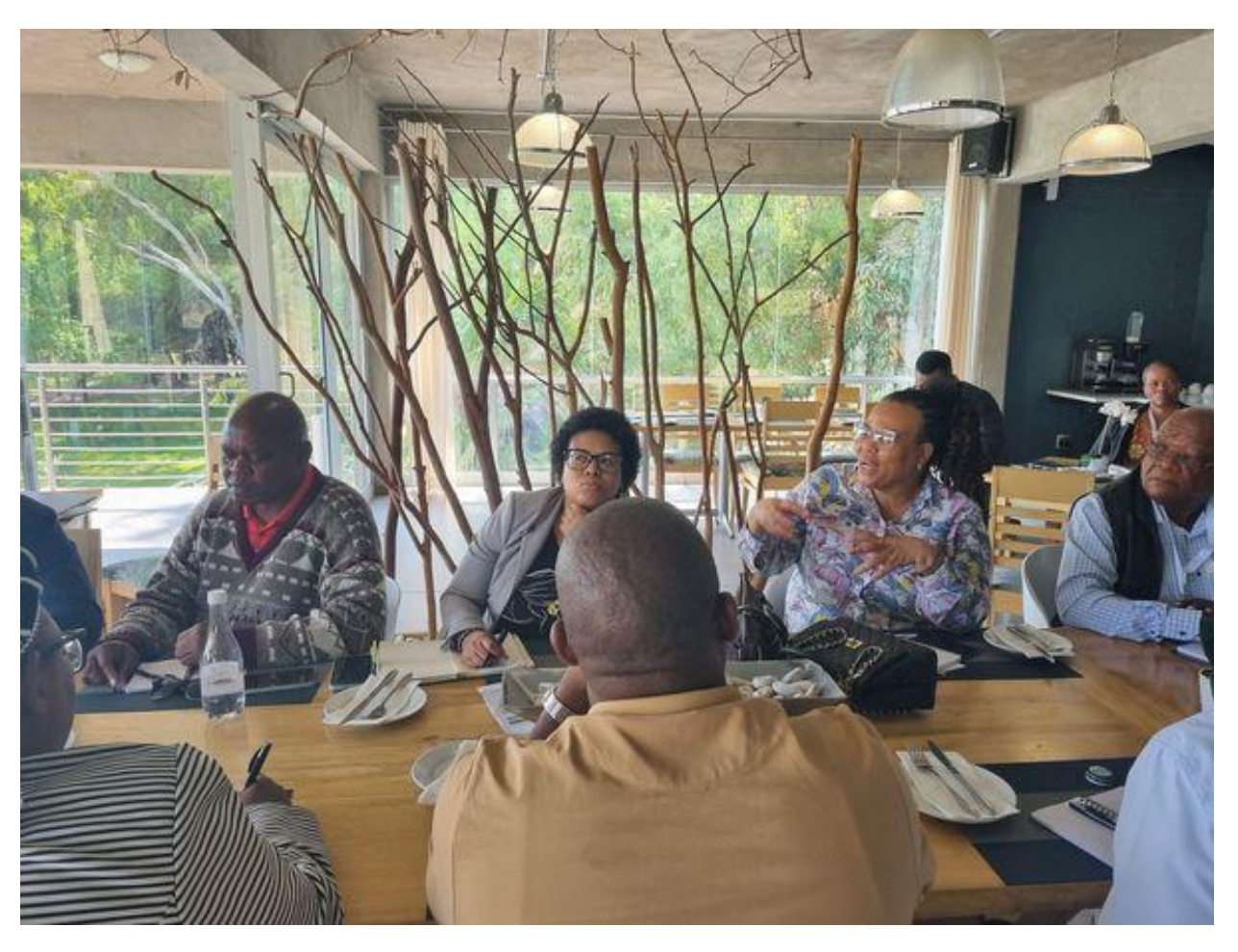
The Executive Mayor & Councillors