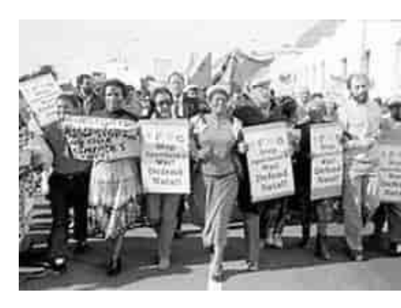
The 1956 women march